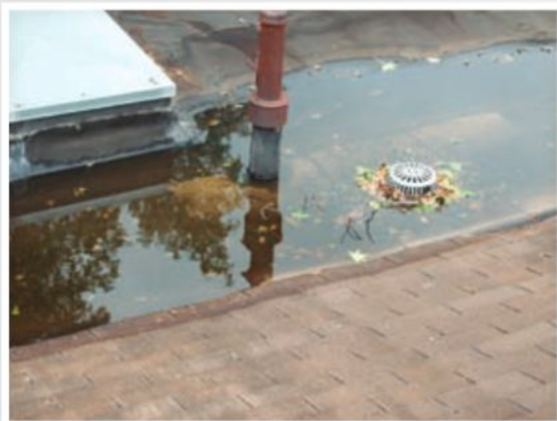
Ponding Water/Clogged Drain

Our decades of experience can identify current and potential issues with your roof - some obvious, some not so obvious. Whether you have a commercial, residential, or multi-family property, our knowledgeable staff of professional roofers can accurately assess your roof's condition, identify problems or potential worries, and provide tips on how to save money by making your next roof, a cool roof. And we do all this at no charge to you.