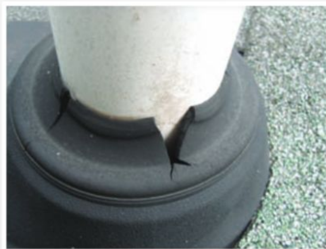
Deteriorated Pipe Flashing