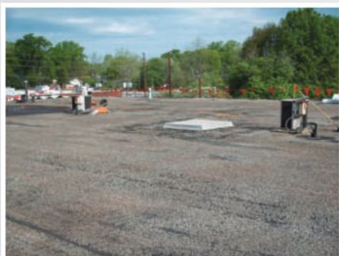
Need a New Roof