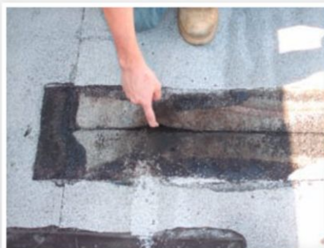
General Roof Repairs